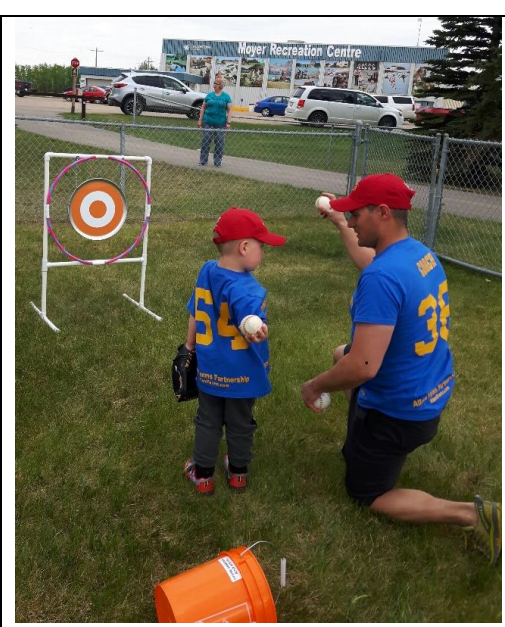
NO Prior Experience Needed

Field Safety Parent – Does a quick walk around all 3 Diamonds looking for debris or perhaps other issues like a dead bird which they would remove or perhaps wasp nests that the County would deal with. First Aid Parents – Preferably one per Diamond to help deal with minor cuts, scrapes or bumps using the First Aid kits provided.